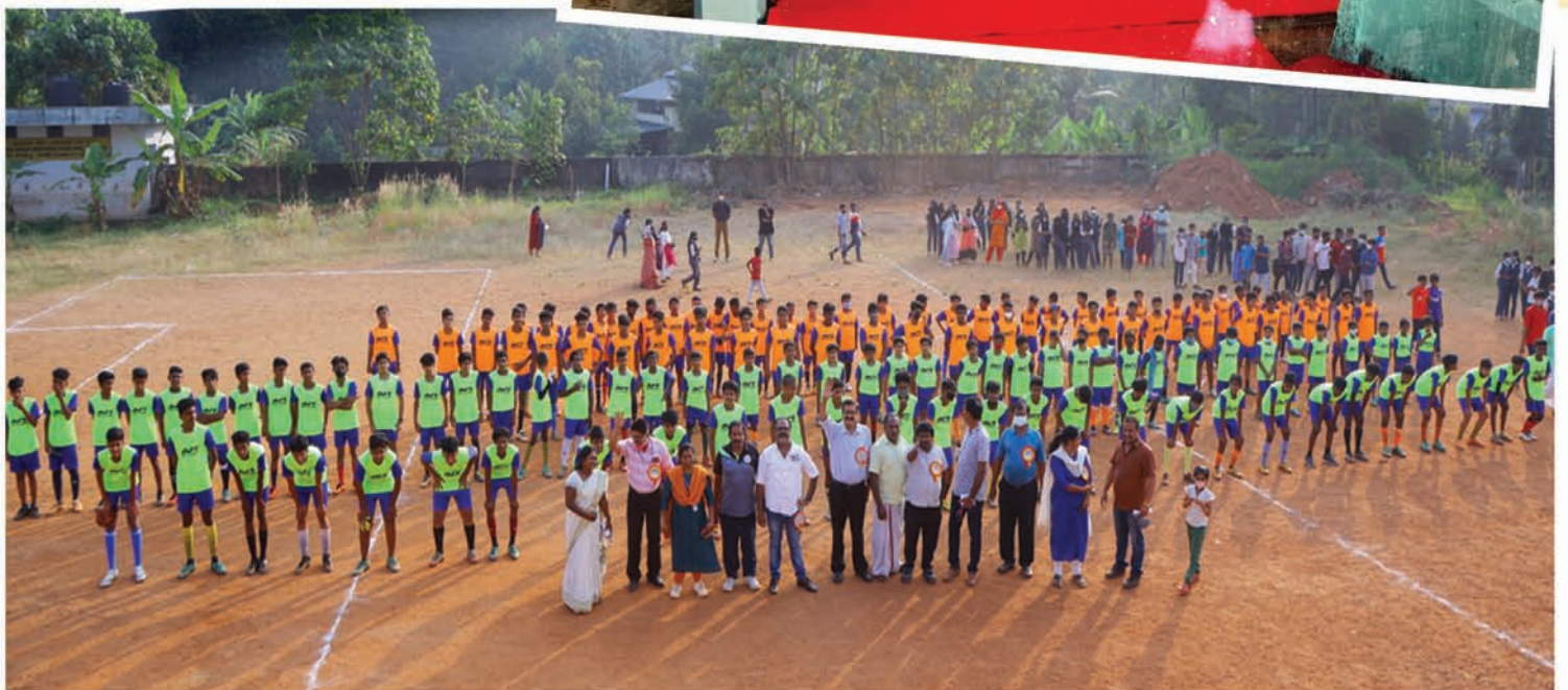
Encouraging Rural Sports organizing Football coaching camps for Students of Government schools in Vazhakulam