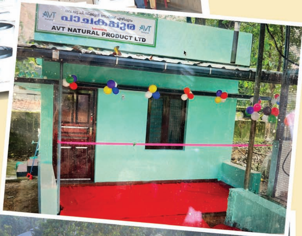
Govt. U.P. School North Ezhipuram Pachakasala