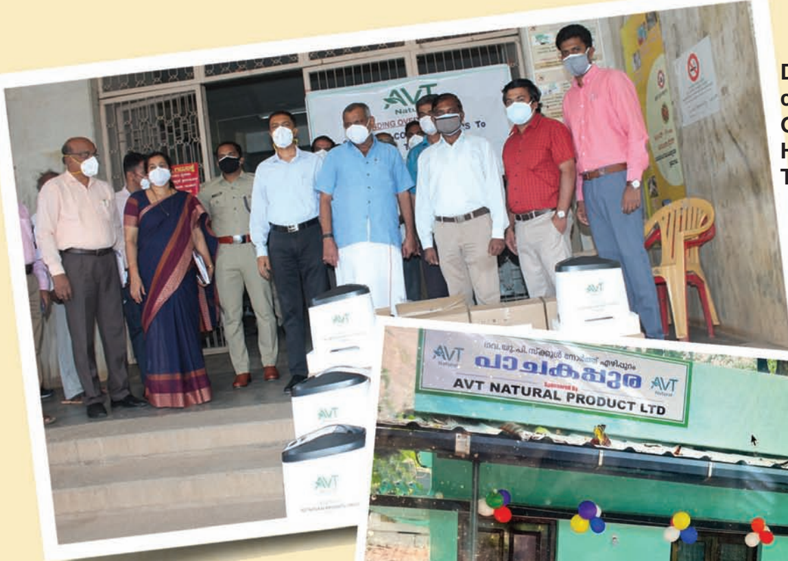
Donation Oxygen concentrators to Government Hospitals in Tumakuru District